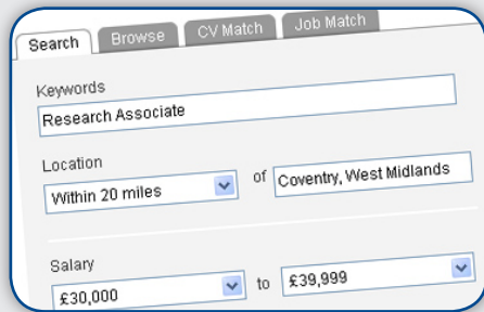
Advanced search options